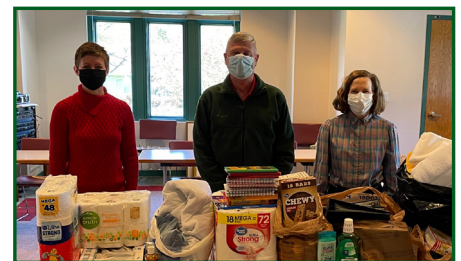
Recent Blessings Collection from Blacksburg Presbyterian Church.